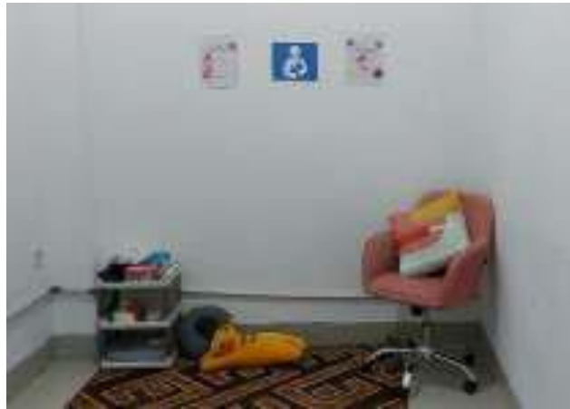
Lactation Room on Unit Pelaksana Tugas Laboratorium Penelitian Terpadu USU

The Lactation Room at the Unit Pelaksana Tugas Laboratorium Penelitian Terpadu (Integrated Research Laboratory) USU is a dedicated facility designed to support breastfeeding mothers within the academic community. This room provides a private, comfortable space for faculty, staff, and students who need to breastfeed or pump breast milk, reflecting USU's commitment to supporting women's health and work-life balance.